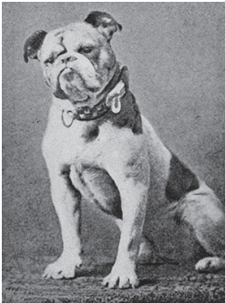
The original Handsome Dan in 1889 (Courtesy Yale Manuscripts and Archives).